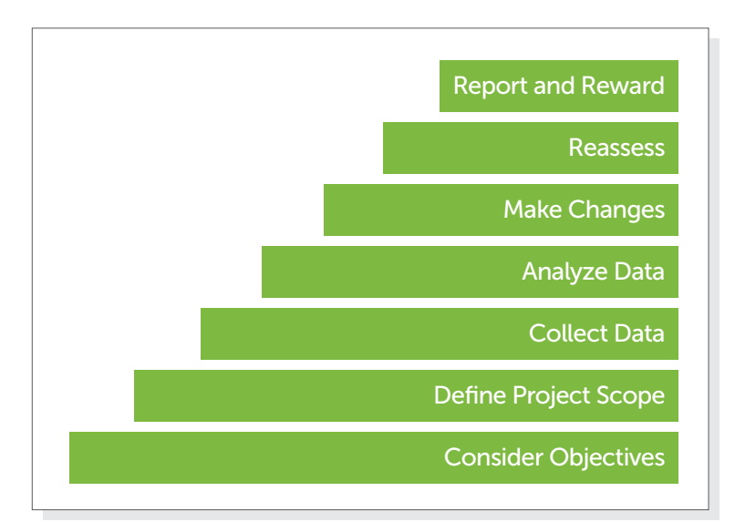
Figure 3: The Seven Steps to Highly Effective MIPS Management