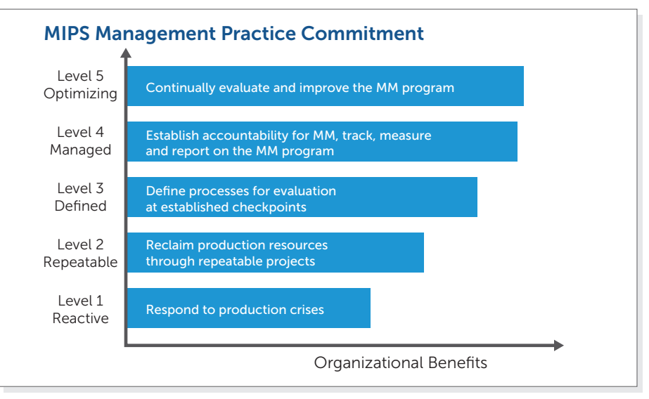
Figure 1: MIPS Management Process Maturity

At this level, we highly recommended you initiate one or more MIPS Management projects with defined goals and objectives. Each project should be assigned to appropriate staff members with sufficient time and authority to ensure capture and correction of all application performance and failure issues. For more specific details, see the section entitled "An MM Project Roadmap."